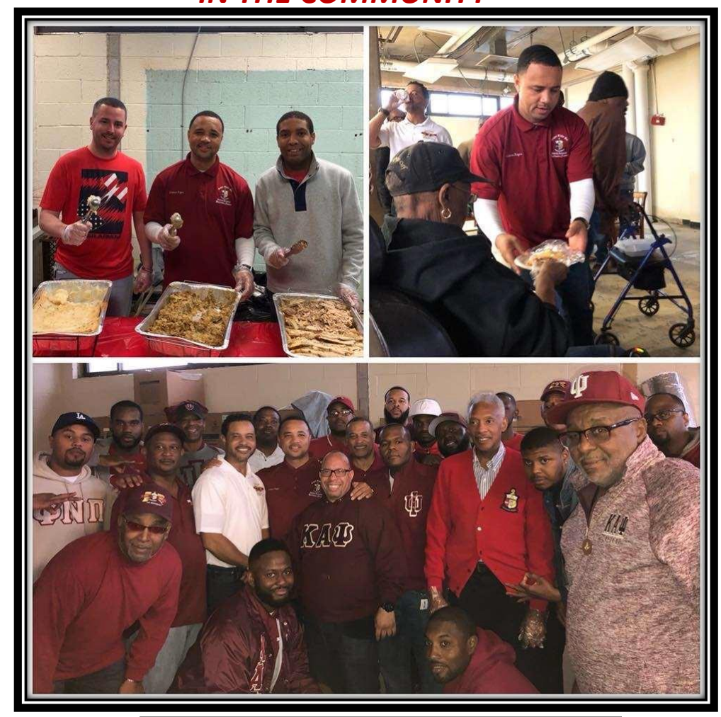
"Thanksgiving For All" with Senator Antonio Hayes