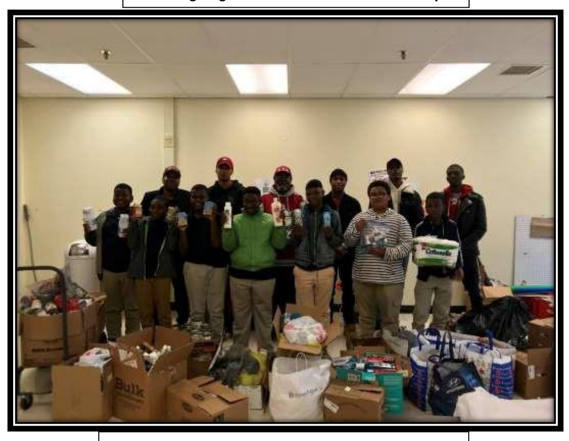
Toiletry Drive with Booker T. Washington Middle School